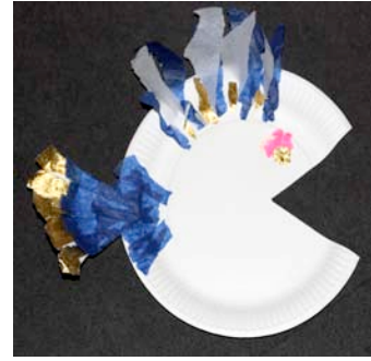
The Little Mermaid

A young mermaid comes of age with dreams of the surface world. To be with a handsome prince whom she saved and fell in love with she strikes a terrible bargain with a sea witch. Stunning imagery evokes the magic and terror in this great cinematic Hans Christian Andersen's adaptation. To be followed by an art workshop for children. Part of Made in Prague: Czech-O-Slovak Film Series 2013 in the Riverside Studios.