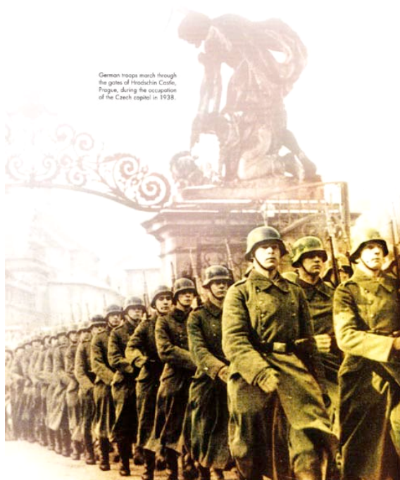
German troops march through the gates of Hradčín Castle, Prague, during the occupation of the Czech capital in 1938.